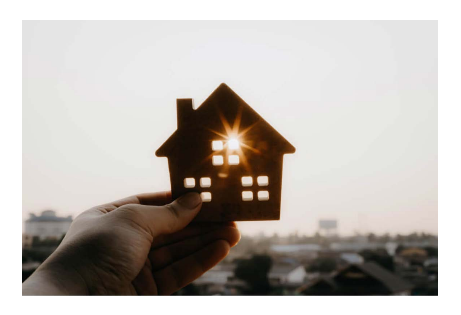
Annual Report FY2022