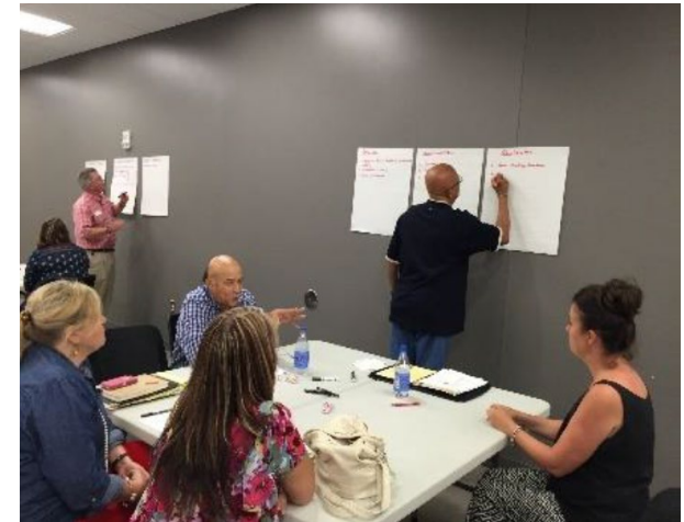
Jones County Plan Meeting

GOAL 1 // CREATE AND IMPLEMENT A PLAN TO REVITALIZE AND REACTIVATE DOWNTOWN, AND BRING IN NEEDED ACTIVITY TO THE AREA