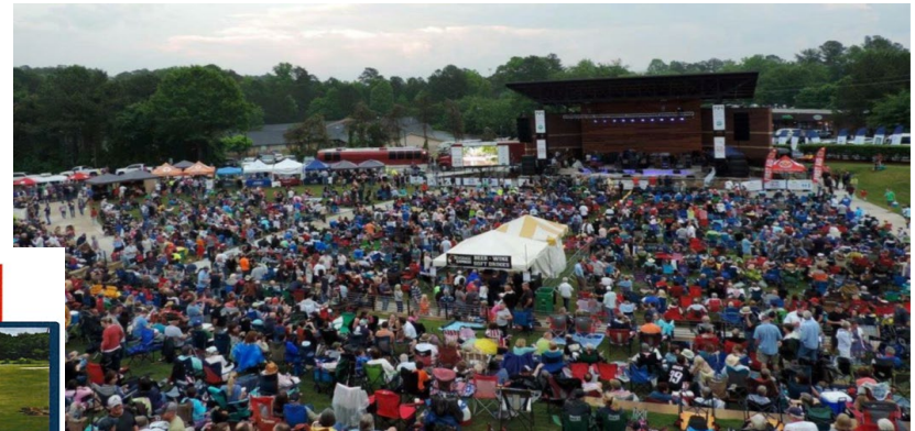
Amphitheater in Woodstock City Park