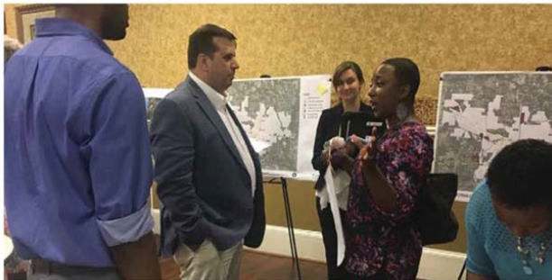
Community member interacting with members of the Project Team at a Planning Workshop