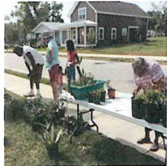
City of Thomasville Victoria Place Overlay District