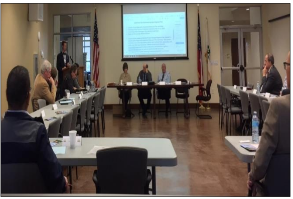
NWGRC Council Meeting, Regional Plan Update February 2019

NWGRC prepared this 2023 Annual Report on the Regional Plan Implementation Program according to Georgia Department of Community Affairs Regional Planning Requirements. It includes an annual Report of Accomplishments for FY 2022, a report on Local Government Minimum Standards, and additions or deletions to the current work program for 2023-2026. This report has been reviewed by the Northwest Georgia Regional Commission Council and regional stakeholders including representatives of the Georgia Department of Community Affairs and Georgia