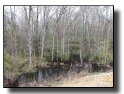
Wetlands along Doctors Creek

There are significant wetlands found within Long County. Most of the county's wetlands occur in the eastern sector of the county. Current estimates indicate approximately 42 percent of Long County may be defined as jurisdictional wetlands.