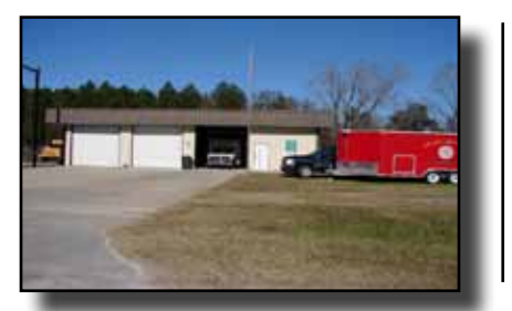
Emergency Services Facility in Ludowici