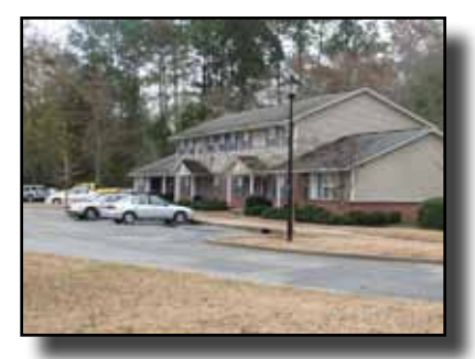
Apartments in Ludowici

With over 97 percent of the housing stock mobile homes and single family houses, there is a need for more diversity in housing options. Diversity in the housing options will provide affordable and rental properties to better meet the needs of citizens just entering the housing market along with the retiring population looking to downsize or are requiring assistance for daily living.