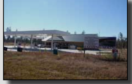
New Business Development