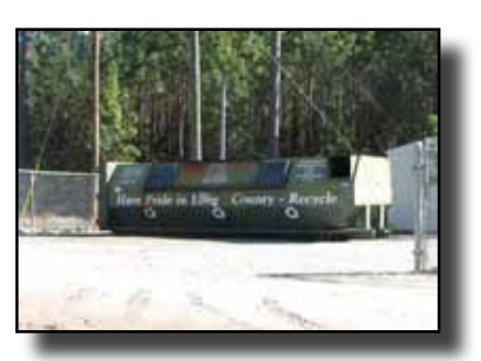
Long County Recycling Drop-off Facility

The County and City do not have a greenspace plan. Long County and the City of Ludowici recently adopted a Land Development Code and Zoning Map. While the City of Ludowici provides community water and sewer services, none are available in unincorporated areas of the County at this time, requiring lots to be sized to accommodate separate wells and/or septic systems. The Griffin Ridge Wildlife Management Area is located southwest of Ludowici along the Altamaha River. The State has acquired additional lands along the Altamaha River and is currently drafting a management strategy.