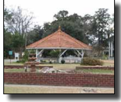
Ludowici Well Pavilion

Long County and the City of Ludowici are definitely characteristic of rural inland counties of the Coastal region in terms of architecture, landscape, culture, commerce, and education. A significant portion of the County continues to be utilized for forestry and agriculture. The City of Ludowici is the activity center for Long County, serving as home to the county government and the county schools, and is the commercial service center for Long County.