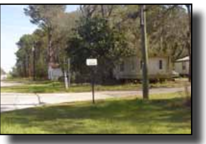
Mobile Home Development

<u>Housing Choices:</u> A range of housing size, cost, and density should be provided in each community to make it possible for all who work in the community to also live in the community (thereby reducing commuting distances), to promote a mixture of income and age groups in each community, and to provide a range of housing choice to meet market needs.