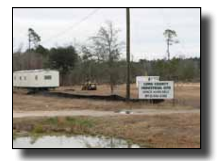
Long - Ludowici Industrial Park Development