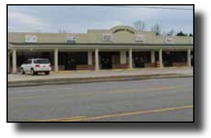
Recent Commercial Development on US Highway 84

Within Long County and the City of Ludowici education, government and retail services are the major employers. The County and City are constantly looking for opportunities to expand the employment base and provide educational and training opportunities for their citizens.