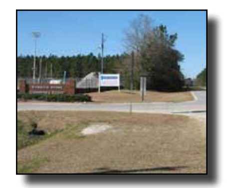
No Sidewalk to Smiley Elementary

There is on-demand transit available in Long County and the City of Ludowici. There is a sidewalk network serving much of Ludowici that allows people to conveniently and safely walk to a variety of destinations. There is a need to extend the sidewalk network to reach activity centers not currently connected, such as the Smiley Elementary School, the Long County Senior Center and the Ludowici City Hall.