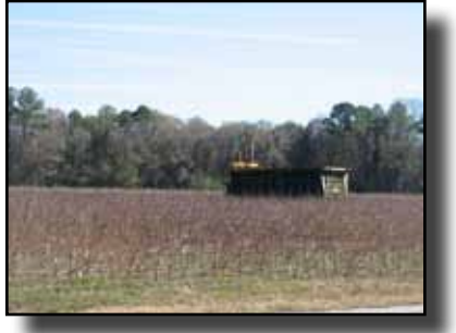
Long County Agriculture

Long County and the City of Ludowici adopted a joint Land Development Code and zoning maps in November 2008 and have established a joint Planning Commission. The County Planning and Building Department serves as staff for reviewing all land development applications for the County and City. The County Commission and City Council have final approval authority over proposed developments within their respective jurisdictions. The Coastal Regional Commission (CRC) is developing model design standards for the region. Both Long County and the City of Ludowici will consider adopting the CRC Model Design Standards to use when evaluating development proposals.