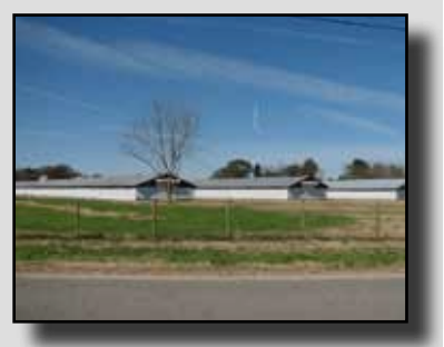
Long County Agriculture