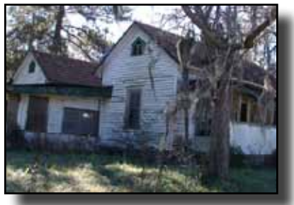
Dilapidated House in Ludowici

Traditional neighborhood development can be found in the City of Ludowici, where residential development is occurring primarily within the existing city limits. Long County has a rural development pattern with large lots. This continues to be the primary development pattern within the County since there are no community water or sewer systems outside of Ludowici. One residential development crosses the Long Co-Liberty County line, and is serviced by the City of Walthourville water supply system.