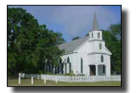
Historic Walthourville Presbyterian Church

Opportunity exists within the City of Ludowici for infill development. Long County continues to experience a rural development pattern though much of the development is occurring in the north central part of the County near Walthourville, and adjacent to Ludowici. Long County and the City of Ludowici adopted a joint Land Development Code in November of 2008. Adoption of the Land Development Code gives the County and City the basic tools to direct development within their jurisdictions.