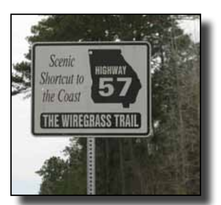
Wiregrass Trail Scenic Route

Highway 84 has opportunity for commercial corridor redevelopment, particularly within the City of Ludowici. The Long County -City of Ludowici Industrial Park is located along US Highway 84 just north of Ludowici. Highway 57 is commonly referred to as a scenic route, known as the Wiregrass Trail. The development of guidelines will protect viewshed, and can preserve the character of the area.