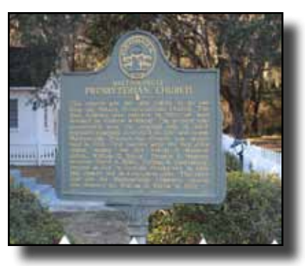
Walthourville Presbyterian Church

<u>Heritage Preservation:</u> The traditional character of the community should be maintained through preservation and revitalizing historic areas of the community, encouraging new development that is compatible with the traditional features of the community, and protecting other scenic or natural features that are important to defining the community's character.