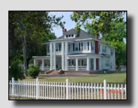
Historic Neill McQueen Mansion