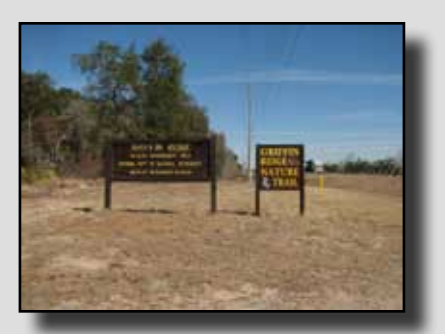
Griffin Ridge Wildlife Management Area