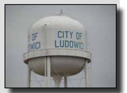
Water Tank at Industrial Park