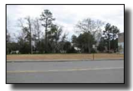
Downtown Ludowici Infill Opportunity

The north western portion of Long County is part of the Fort Stewart military installation. The area surrounding the base has been designated the Army Compatible Use Buffer (ACUB). The goal of this buffer is to provide an acceptable and beneficial use of land for the community and to sustain the military training mission. The area around the base within the county is primarily agricultural with some conservation. Preferred uses in this area are agriculture and conservation. The development of residential areas in this area may adversely affect the use of the base and could contribute to a reduced mission or potential Base Realignment and Closure scrutiny.