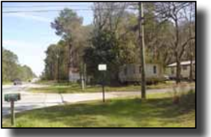
Mobile Home Development