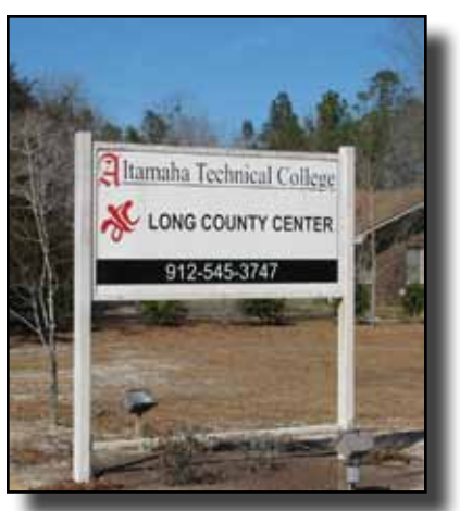
Technical training available in Ludowici

Most of the housing within Long County and the City of Ludowici is manufactured/mobile homes followed by single family houses. Many of the single family houses were constructed prior to 1980. Much of the new homes being constructed are for higher income households, with manufactured/mobile homes being the affordable housing option. There is a recognized need for more rental options, especially multifamily units.