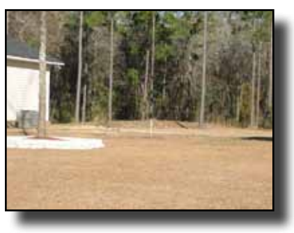
Septic Tank Mound