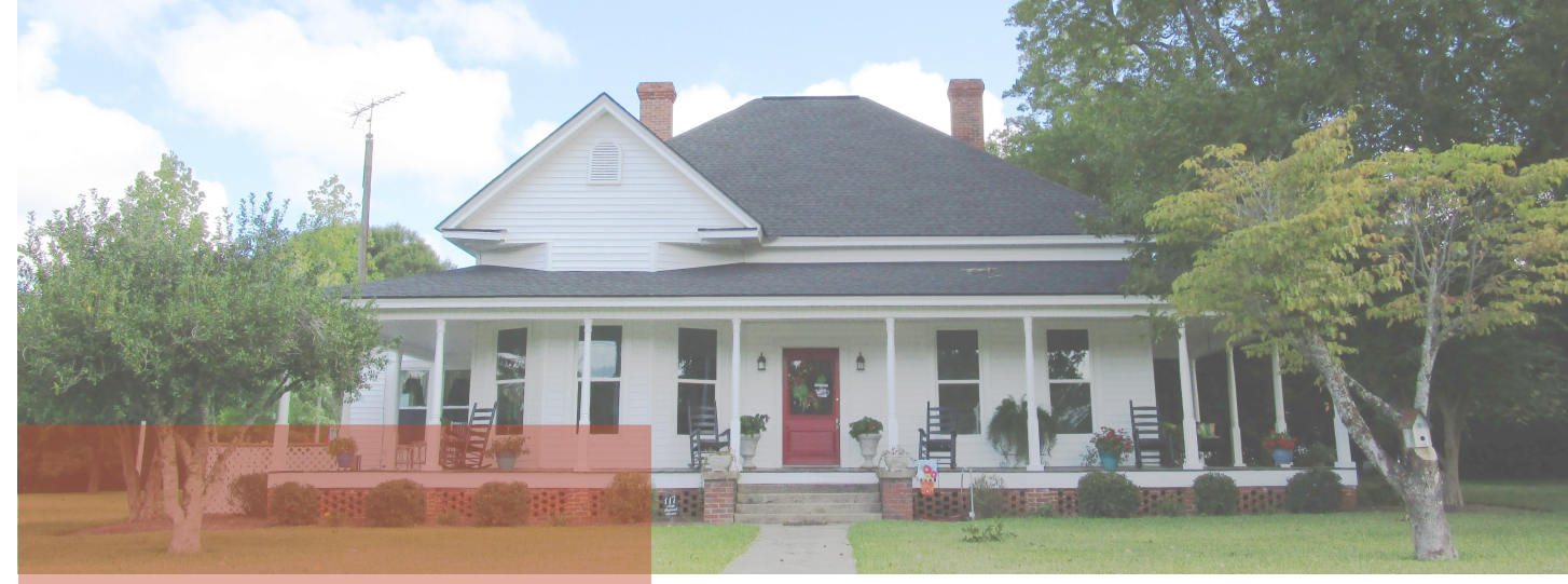
Historic Residence, Chauncey