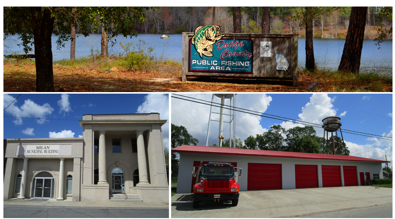
U Dodge County Public Fishing Area BL Milan Municipal Building BR Milan Fire Department

Exodus of younger generation due to minimal job opportunities, difficulties to bring in quality people to work in the area is a major challenge facing the county now. In addition to assistance to help local entrepreneurship grow by supporting incubators, matching grants, helping with advertisement, etc., the county is also willing to provide a diverse range of opportunities for citizens to influence decision making processes in government and economic development. The county will encourage leadership development and community empowerment, enhance trust between citizens and public employees/officials, thus, improving collaborative community efforts, offer a variety of ways to involve different sectors of the community. Along with the loss of younger generations, serious crimes such as drug-use and gang activities pose another serious challenge to the community. As a reply, Dodge County shows a strong resolution in pursuing more effective actions to reduce and deter drug-use, addiction, gang activities, and other crimes in the community.