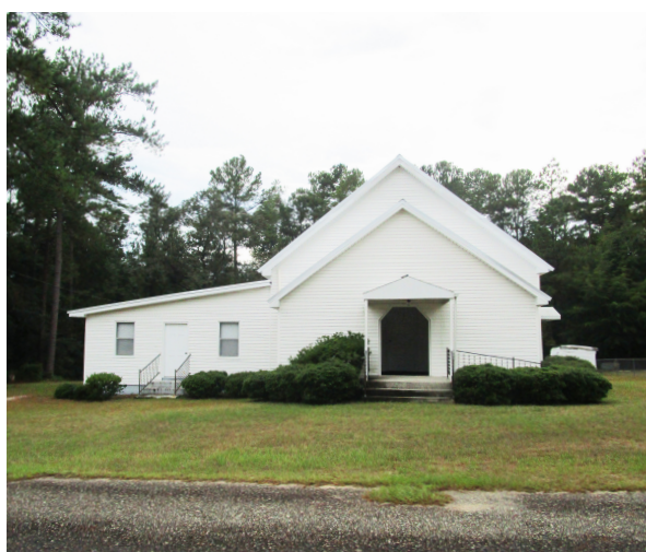
L Chester Gymnasium R Sweet Home Primitive Baptist Church