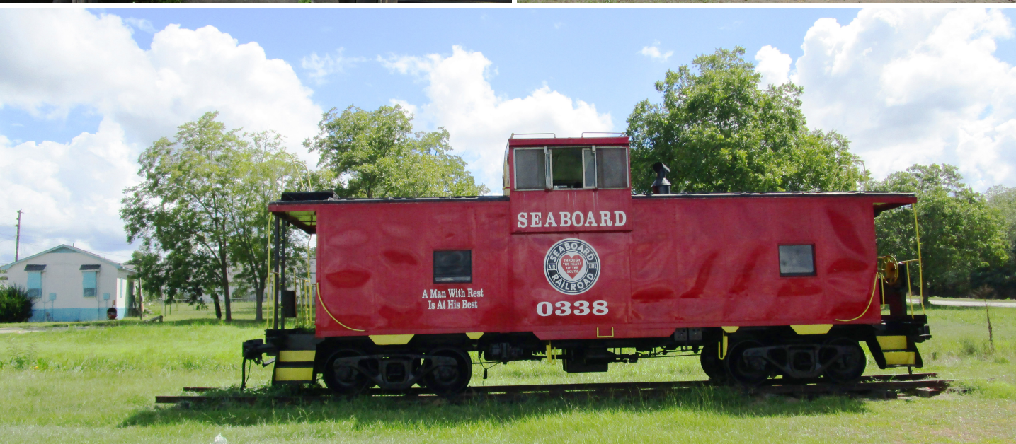
L Millan Aquaponics R Historic Milan Depot B Historic Caboose