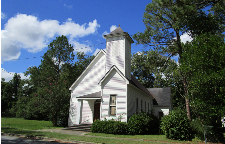
L Downtown Rhine R Historic Methodist Church