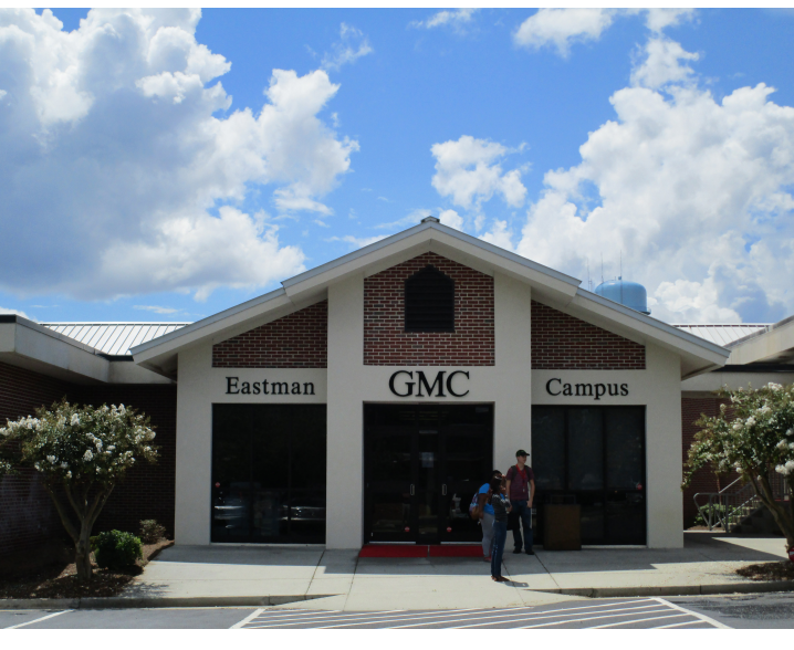
L Eastman Farmers Market R Georgia Military College, Eastman Campus