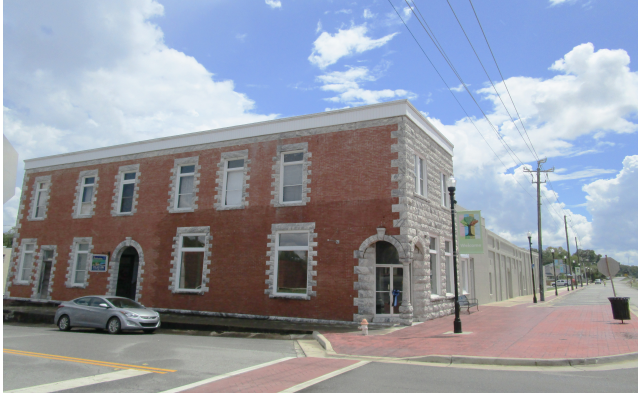
L Heart of Georgia Regional Airport R Downtown Eastman

ding many active civic clubs, churches of all denominations, an involved Arts Guild, and an acclaimed Music On Main which regularly has performances in a renovated downtown 1942 Magnolia Theater which are simulcast on the radio. The community is also supported by a very active Eastman-Dodge Chamber of Commerce with a state-of-the-art conference center with 10,000 square feet of event space and catering capabilities. All of Eastman's exceptionalism and outstanding municipal offerings are provided in the still stunning surrounding pastoral beauty of the rolling countryside of farms and verdant pine forests and the nearby outdoor adventure and fun afforded by the mystic and historic Ocmulgee River. Eastman truly is an unexpected and unequaled rural center of extraordinary offerings, quality of life, and unique potential.