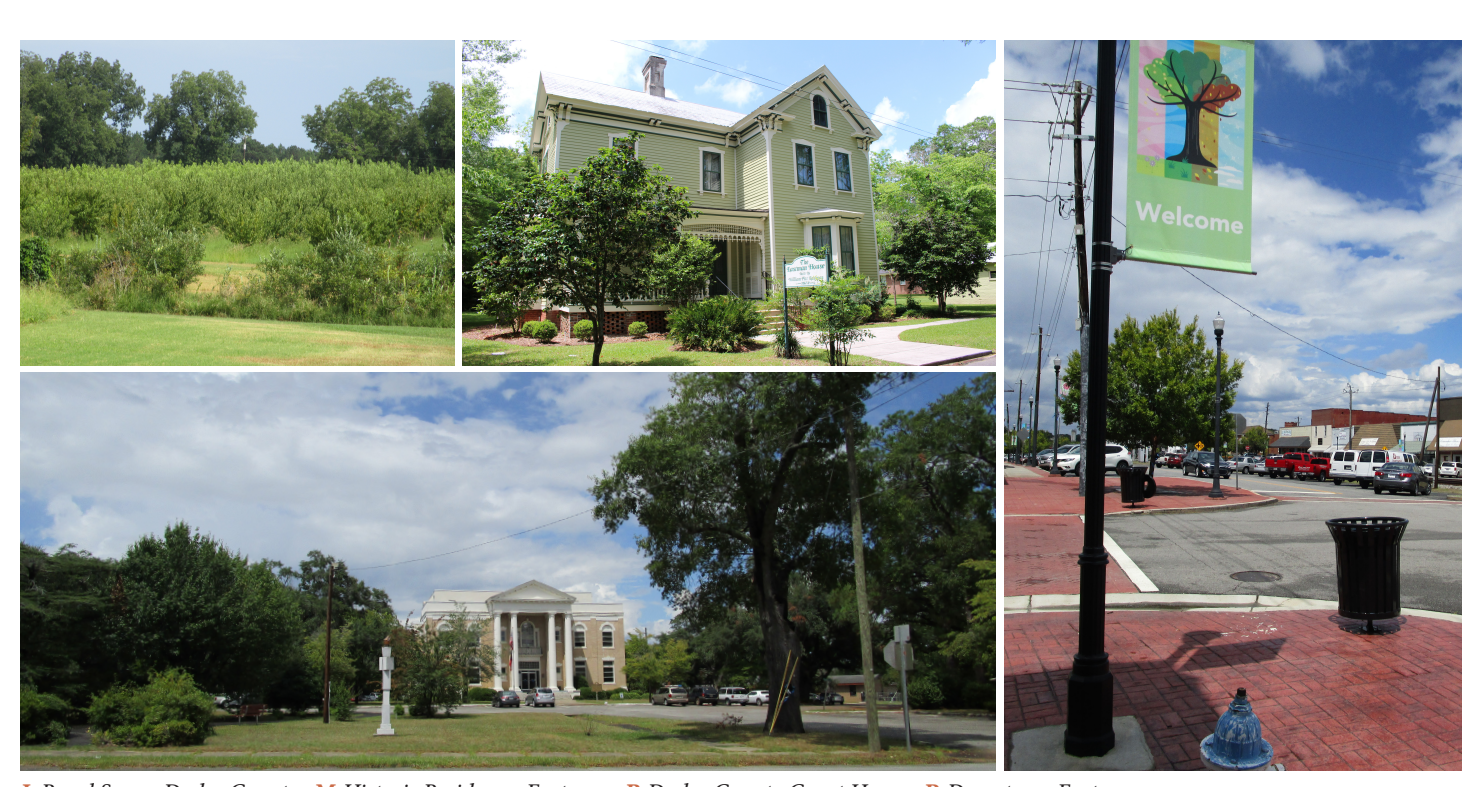
L Rural Scene, Dodge County M Historic Residence, Eastman B Dodge County Court House R Downtown Eastman

trial, and other high-density uses will concentrate in or near Eastman in the Greater Eastman Growth Area, primarily because of infrastructure availability and the existing concentration of growth and its support structure. Additional retail, hospitality, entertainment, and other public and private services facilities and infrastructure will be supported, incentivized, and added to appropriately serve the population, tourist sector, and the resulting economic growth. This will further improve the levels of service and the overall quality of life. The City of Eastman will promote of downtown events, offer incentives to downtown businesses and building owners, create policy to encourage façade improvement, historic preservation, and discourage blight, seek funding to install and repair infrastructure, and nurture downtown activity and business development overall.