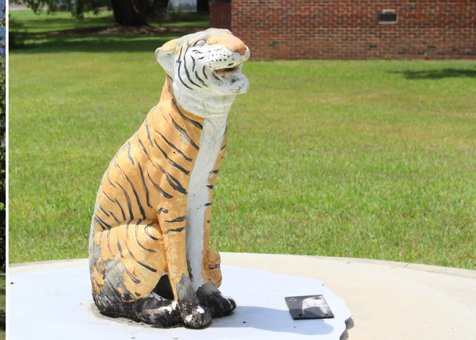
L Historic Residence R Community Decoration