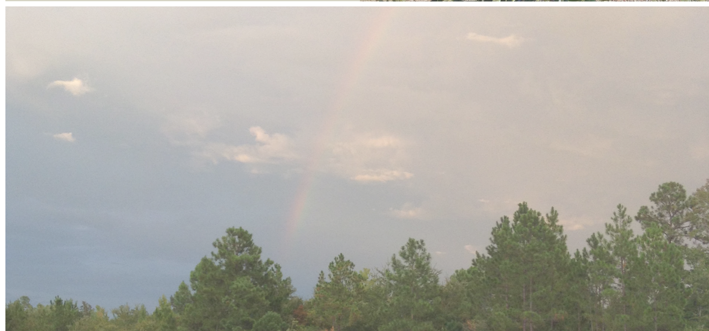
U Olive Orchard R Pine Trees and Rainbow, Dodge County