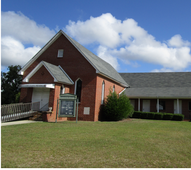
L Chuancey Municipal Center R Chauncy United Methodist Church