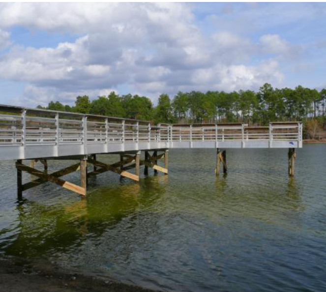
Dodge County Public Fishing Area

The small towns of the county will be thriving, growing villages with expanded community facilities as necessary to attract further growth and support the populace. Representatives in the public and private sector will strive to decrease litter and provide a range of recreational infrastructure, outlets, public spaces, and activities for families. Diverse, community-wide events will be curated and promoted through the participation of public institutions, faith-based organizations, businesses, civic clubs, and educational organizations. The small towns will be further examples of preserved history in a modern, functional setting, adding additional dimension and character to the outstanding quality of life in Dodge County.