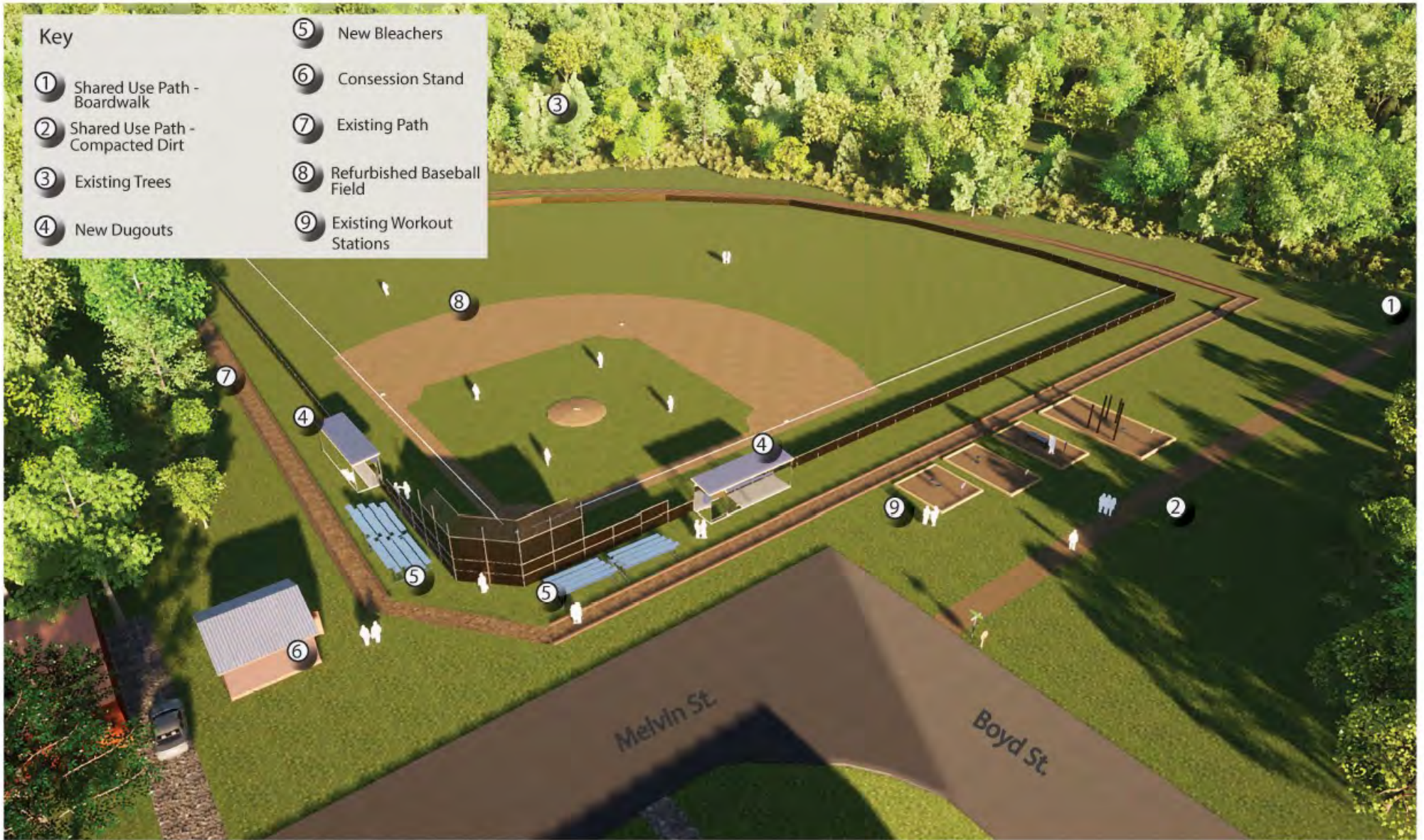
Calhoun County: Healthier Together Leary Baseball Field and Shared-Use Path Perspective View