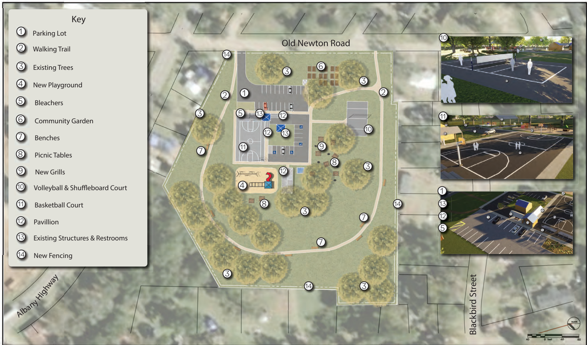
Leary City Park Masterplan