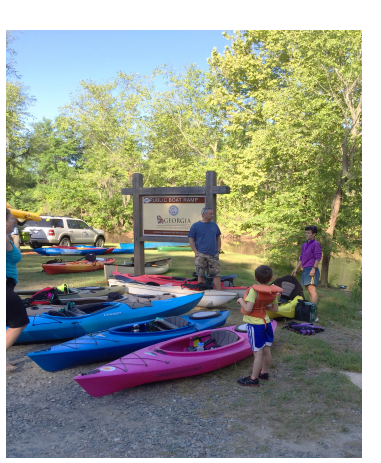
L Heartland, Bleckley County R Public Boat Ramp