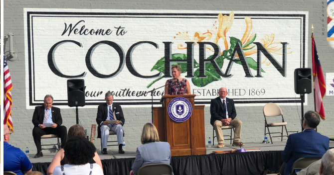
L Public Meeting R Downtown Cochran

The next portion of the SWOT analysis pertained to identifying opportunities in Bleckley County. The county has the opportunity to expand its relationship with the university and technical colleges in the area which could help to increase economic activity within Bleckley County. Subdivision opportunities also exist within the county given the affordable land prices. While vacant buildings are seen as a weakness, they are also an opportunity for redevelopment. The expansion of the Federal Park Ocmulgee National Monument is also an opportunity for Bleckley County to increase tourism and offer more recreational activities. Another opportunity is for Bleckley County to capitalize on its close proximity to the Air Force base in Warner Robins.