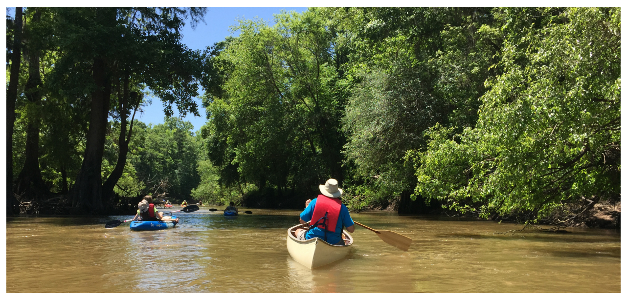
Paddle in Ocmulgee River, Bleckley County

and culture not usually expected in a rural, smalltown. Today the community is home to the main campus of Middle Georgia State University campus, the only university in the Region. Bleckley's fields and forests have provided much past economic influence, and continue to do so today. Agriculture contributes over $30 million in direct farm gate impacts to the local economy annually, and has been another avenue of local leadership and exceptionalism. The community has experienced some economic setbacks in recent years, but its location, outstanding quality of life, and economic influence from the nearby Robins Air Force Base, have allowed for continuing growth. Its fields, forests, and verdant natural resources including the Ocmulgee River, Ocmulgee Wildlife Management Area and Public Fishing area provide an appealing scenic backdrop and outlets for outdoor fun and adventure which only add to the exceptional quality of life enjoyed by the community.