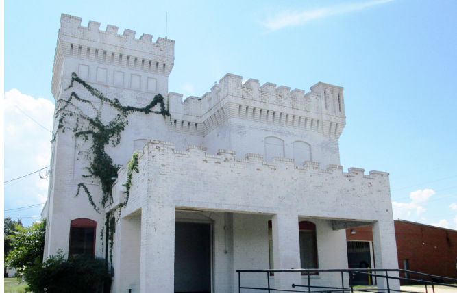
L Social Facility, Gully Branch Tree Farm R Bleckley County Jail