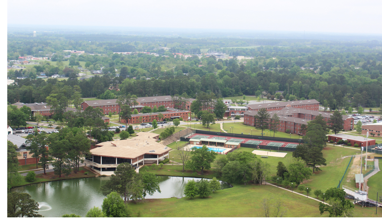
Middle Georgia State University

Bleckley County continues to build today on its extraordinary history of leadership, education and culture unique to a rural smalltown. The community boasts of not only the campus of Middle Georgia State University but an awarded, high quality local school system; an outstanding adult learning center; a modern library; a well-managed local hospital; a general aviation airport; many active and involved civic clubs including Pilot Club Rotary, and Maso-