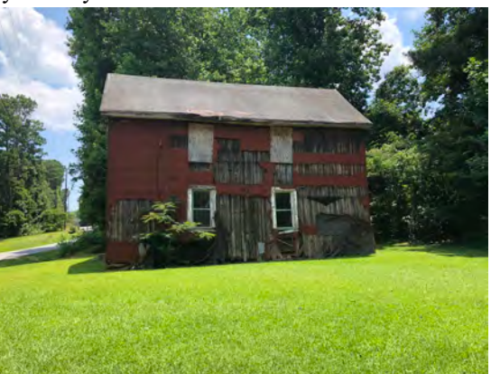
Pleasant Grove School. Douglas County, Georgia.

Many from across the state and country have visited the county to pay their respects to this piece of history while she still stands. In 2023, The Georgia Trust for Historic Preservation listed this site on their "Places in Peril." The Pleasant Grove and Douglas County communities are working in tandem to obtain the necessary resources to save the building under the motto, "The time is now to save yesterday."