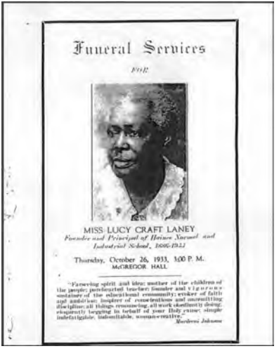
An example of a funeral program for Miss Lucy Craft Laney. Link found in Digital Library of Georgia, provided by Tamika Strong.

After reading an article in Georgia Library Quarterly about the funeral program collection at the then East Georgia Regional Library System, I was inspired to create a collection of funeral programs for the Atlanta area.