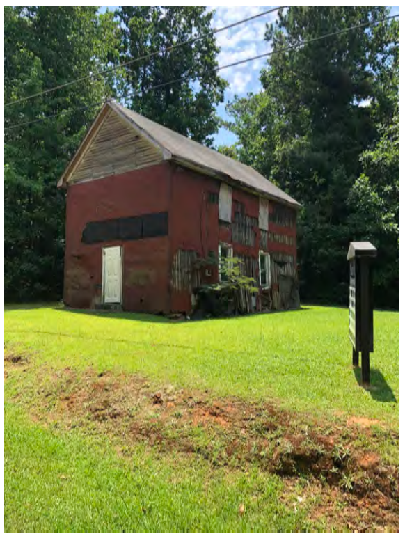
Pleasant Grove Missionary Baptist Church est. 1881, Pleasant Grove School est. 1910. Douglas County, Georgia.

Although "Douglas" County was established five years after the end of the Civil War, portions of the lands taken to create it had an ancestral connection to formerly enslaved Africans. Sitting just west of Atlanta, this once heavily vegetated area proved ripe for development and possessed endless possibilities for all willing to work. In the late 1800s, it was a new beginning for the direct descendants of those who, for centuries, mastered the cultivation of the earth. As such, these local Africans were equipped to skillfully embrace farming for survival. The very crops birthed out of their labor would eventually serve as the catalyst for holistic support to help families and even passers by who found themselves in need. This support was critical because historical accounts reveal that it took decades for the dust to truly settle from this country's brutal homegrown war; as a result, some communities were still punch-drunk. A post-Reconstruction Georgia was heavily burdened with widespread housing, health, and food shortages. The collective fears of a nation grappling with looming homelessness and child starvation fueled this black community's pursuit or, rather, race toward education.