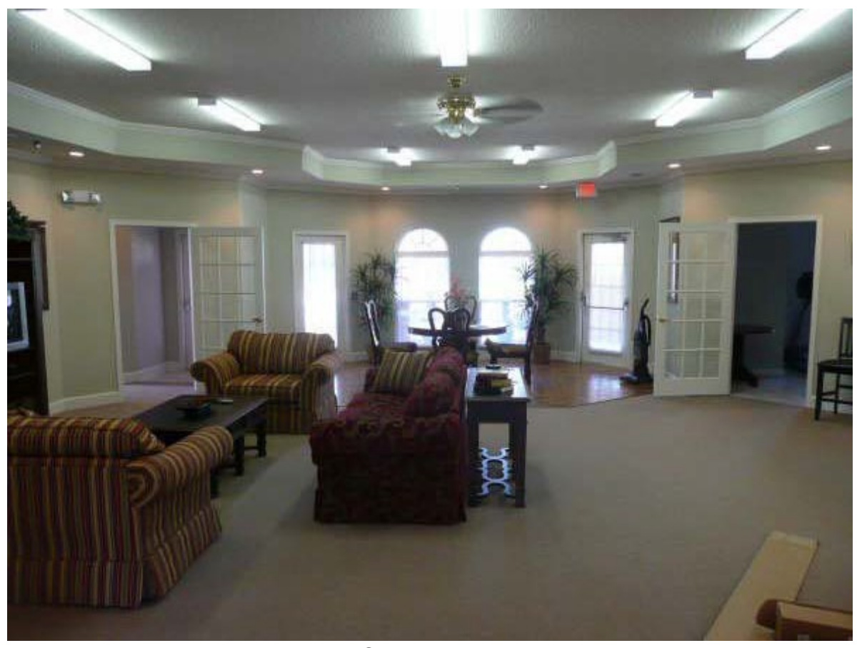
Acceptable Community Room Interior