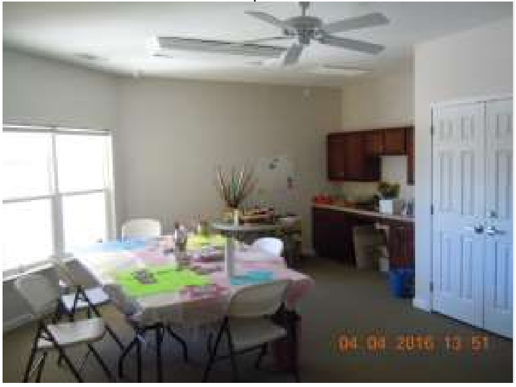
Not Acceptable (Uninviting room without decorations and use of folding furniture and table)