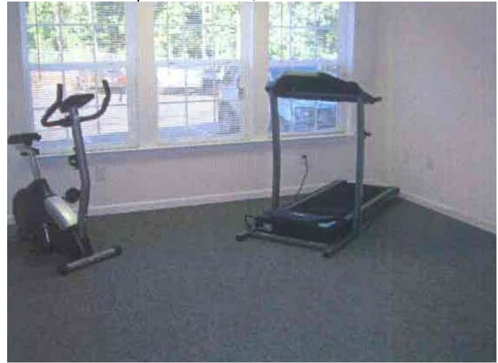
Not Acceptable Equipment is used and not commercial grade. There is not enough equipment for the size of the complex.

There is a variety of commercial grade equipment, cardiovascular equipment rests on slip-resistant mats, and the room is mirrored.