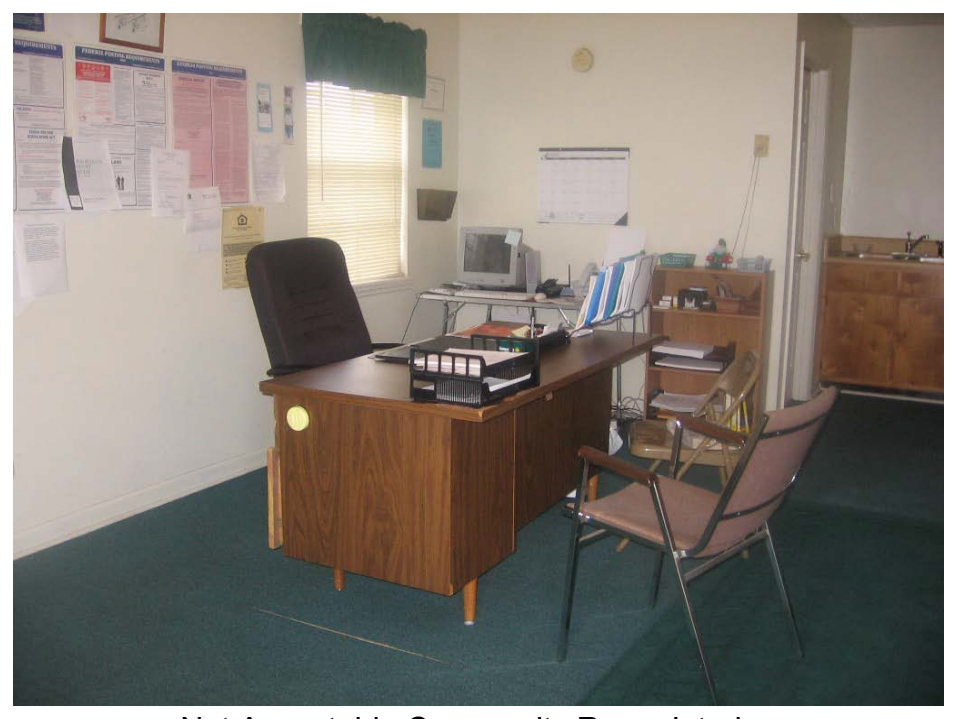
Not Acceptable Community Room Interior

The property manager's office must be separate from the community room.