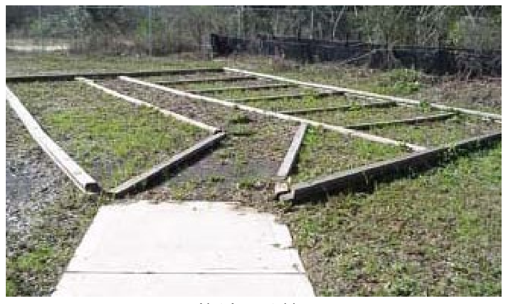
Not Acceptable No fence; overgrown with weeds.

The garden beds are elevated to an accessible height, each plot has a water source, and the plots are on an accessible path.