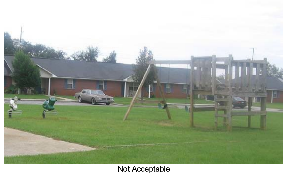
Equipment not constructed in compliance with CPSC guidelines for materials, ladder handrails, or ground cover. There is no observation bench.