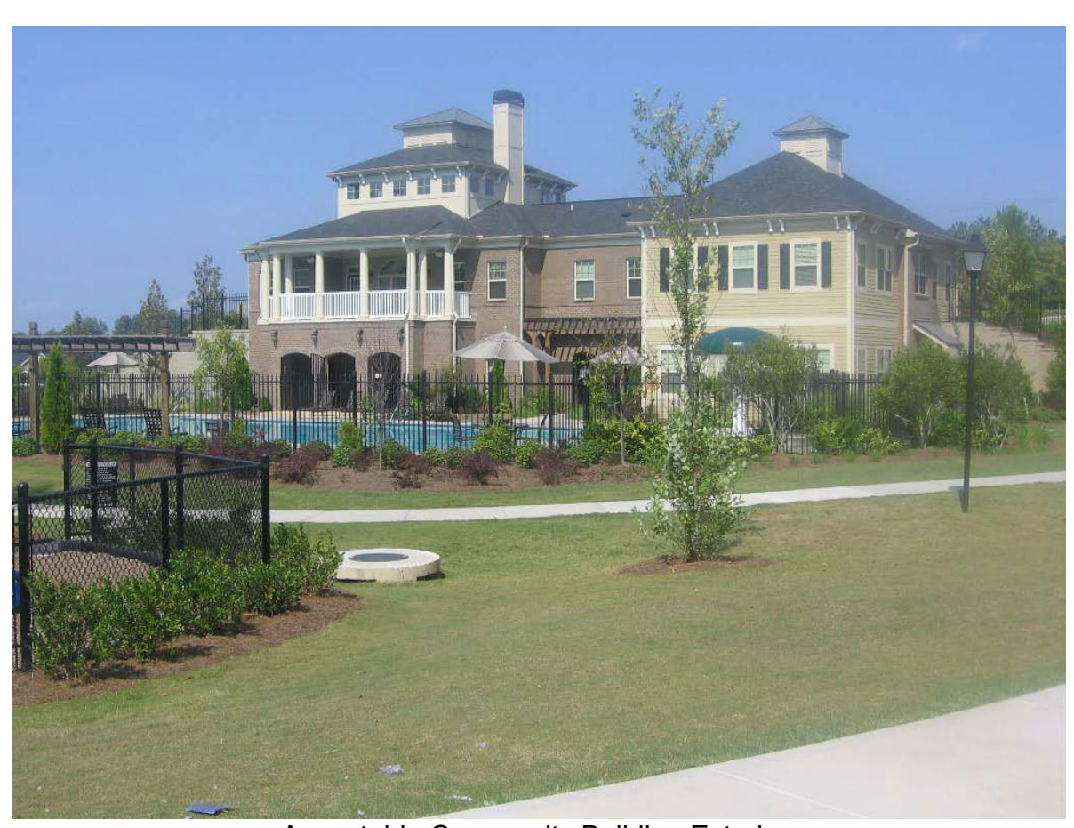
Acceptable Community Building Exterior