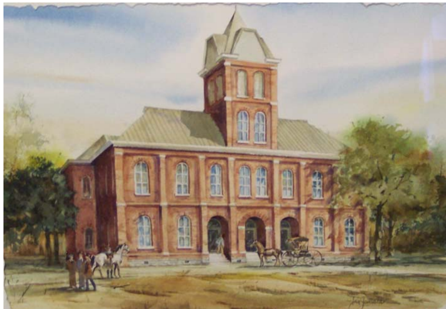
Old Bowdon College 1857 – 1936

Prepared by Chattahoochee-Flint Regional Development Center