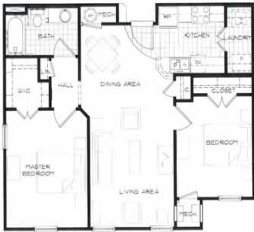
○ TWO BEDROOM B UNIT W/TUB 1/4" = 1'-0"