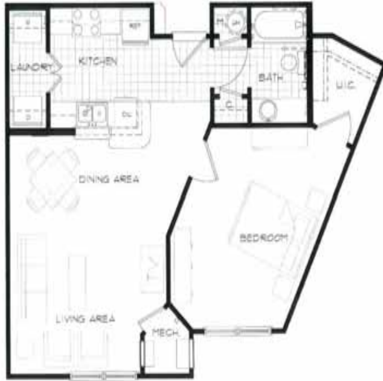
○ ONE BEDROOM A-2 UNIT 1/4" = 1'-0"