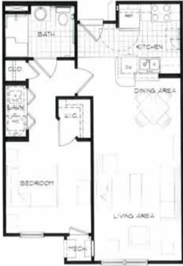
○ ONE BEDROOM 4h UNIT 1/4" = 1'-0"